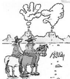
"JUDGING BY THOSE SMOKE SIGNALS, THEY KNOW WE'RE HERE AND THEY'RE NOT AFRAID OF US!"