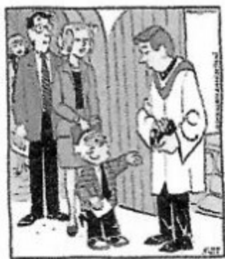
"Which came first... 'In the beginning' or 'A long time ago in a galaxy far, far away'?"