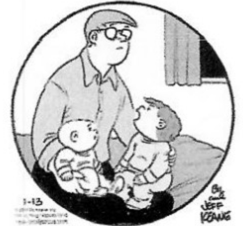
"We don't wanna hear about the Three Little Pigs. Tell us a Star Wars story."

"Which came first... 'In the beginning' or 'A long time ago in a galaxy far, far away'?"