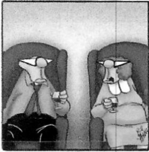
"I felt a disturbance in the Force. Were you about to contradict me?"

Q: Where does Jabba eat dinner? A: Pizza Hutt