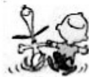
THE WEEKEND DANCE

I take limbo dancing very seriously. In fact, I'd bend over backwards to win a competition.