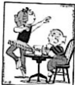
"WHY DON'T YOU DRINK YOU A BEER DRINK... LIKE THE MONEY FUNKY?"

Who is an astrophysicist who loves dancing called? A Rockette scientist!