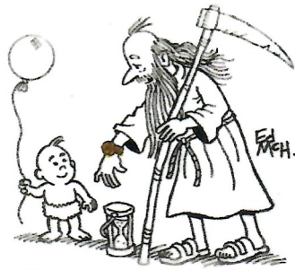
The kids gave me it for Christmas