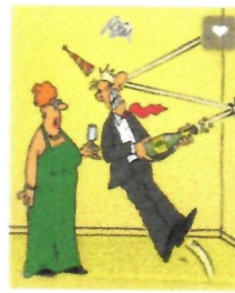
"Off to a bit of a bad start, aren't we, dear?"