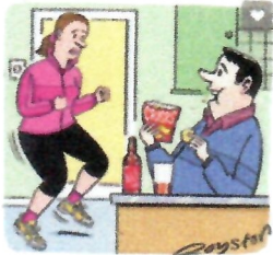
"I've postponed my New Year resolutions until Chinese New Year."

Why is partying in Times Square overrated? The organizers drop the ball every year!