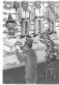
He's the one!