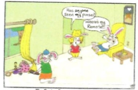
The Easter Bunny as a teenager