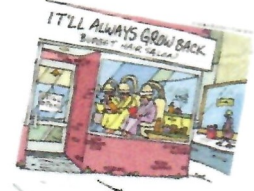
Where Mom used to take you.