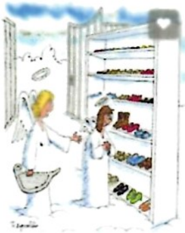
"Yes, we even have shoe shopping. We just refer to it as 'sole' shopping."