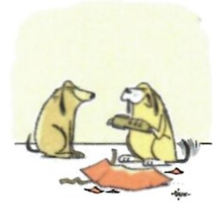
OH IT'S JUST WHAT I WANTED, HOW DID YOU KNOW?!

Shoes come in pairs because they're sole mates