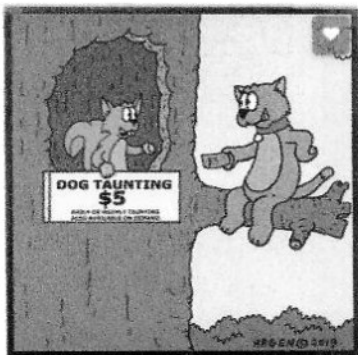
The dog at 21 Bada-jaz road? Yes sure Sir, I can taunt him on Tuesday afternoon if you want..