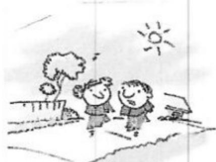
I'm not a big fan of fresh air and sunshine, but it beats helping Dad clean the basement.

A Summer book never written: "Vacations Are So Expensive" by Seymour Foreles.