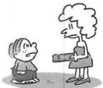
"You expect me to play with educational toys during summer vacation?"

Q: What do ghosts like to eat in the summer? A. I Scream