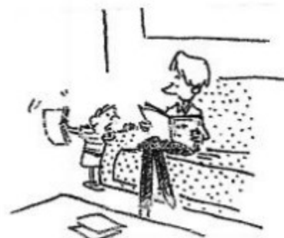
We gotta go to Disney World this summer! It's already in my rough draft of 'What I did on my summer vacation!'

First dog: Where do fleas go for summer vacation? Second dog: Search me!