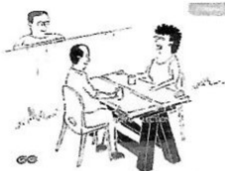
This is the workbench I bought Derek last year to make our picnic table