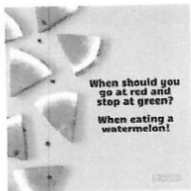
When should you go at red and stop at green? When eating a watermelon!